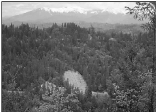
Figure 1. Landscape disturbance resulting from road construction is common in California. This slope (center of photo) was cut for construction of Highway 299, west of Redding.

soil scientists, plant materials experts, and geneticists are working with public and private institutions such as PG&E, CalTrans, the U.S. Forest Service, the Bureau of Land Management, and The Nature Conservancy, as well as with members of the private sector, on a variety of research and restoration projects.