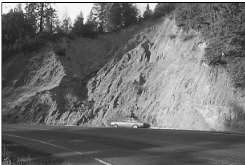
Figure 2. "A" site at Buckhorn Summit. Cut slope samples were composited from loose material at the slope face. Native topsoil was collected from the vegetated area to the upper left.

The A site, 1.0 km (0.6 miles) east of the Shasta-Trinity county line, was located at a large, steep slump area that has not stabilized or revegetated for many years ( Figure 2 ). The site poses a traffic safety hazard, in that it frequently sloughs sandy DG material onto the nearby road. Adjacent natural soils were equally steep (45° above horizontal) but support black