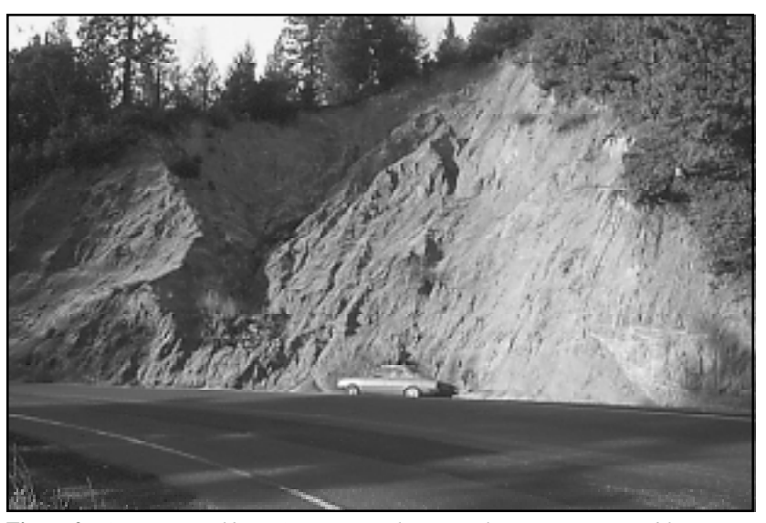
Figure 2. "A" site at Buckhorn Summit. Cut slope samples were composited from loose material at the slope face. Native topsoil was collected from the vegetated area to the upper left.

The purpose of this study, funded by CalTrans, was to compare nutrient availabili-