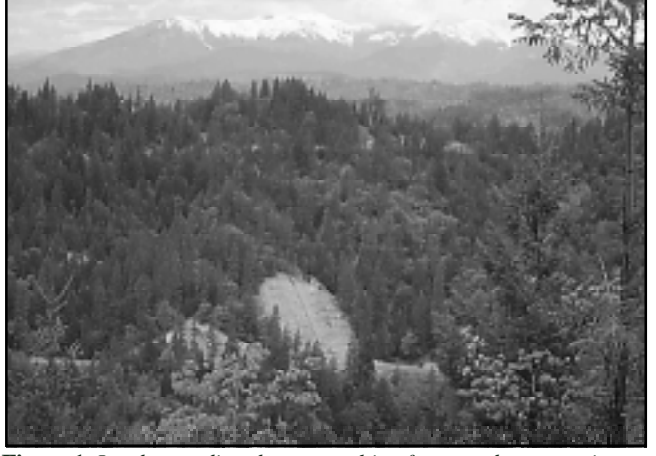
Figure 1 . Landscape disturbance resulting from road construction is common in California. This slope (center of photo) was cut for construction of Highway 299, west of Redding.

Over the last 20 years, restoration ecology—a field that draws its expertise from both ecology and horticulture has experienced exponential growth. The growth of this field, driven by a rising environmental awareness that is often supported by legisla-