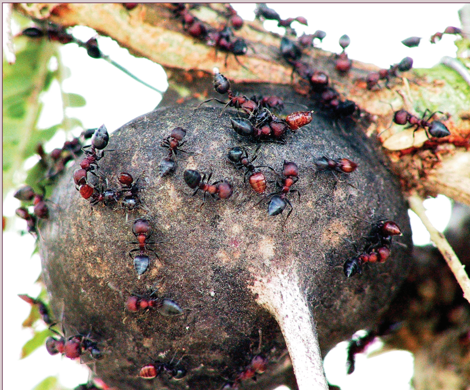
Two ant species battle for possession of a host plant.

The persistence of cooperation between species, or mutualism, despite clear incentives for members to “cheat,” is a classic problem in ecology. Traditional explanations focus on short-term, pairwise relationships between partners, even though many mutualists interact with multiple species throughout a lifetime. Todd Palmer et al. (pp. 17234–17239) monitored annual survival, growth, reproduction, and ant occupancy of 1,750 Acacia drepanolobium trees over 8 years, and constructed demographic models that related the trees’ lifetime fitness to occupation by four mutualistic species of ants. The authors discovered that the trees demonstrated greatest lifetime fitness when sequentially occupied by the set of all four ant species. As part of a set, even parasitic ants that weakened trees while providing low protection increased Acacia lifetime fitness relative to sole occupation by nondamaging highly protective ants. The long-term benefits depended on the timing and year-to-year consistency of occupation, the authors report. While one ant species sterilized the trees, these ants tended to consistently colonize and protect young trees for which survival was critical, and ants that invited herbivore attack helped to promote reproduction in older, better established trees. The authors suggest that mutualistic fitness may depend nonlinearly on duration, contrasting benefits and costs, and ontogenetic timing of partner interactions. — J.M.